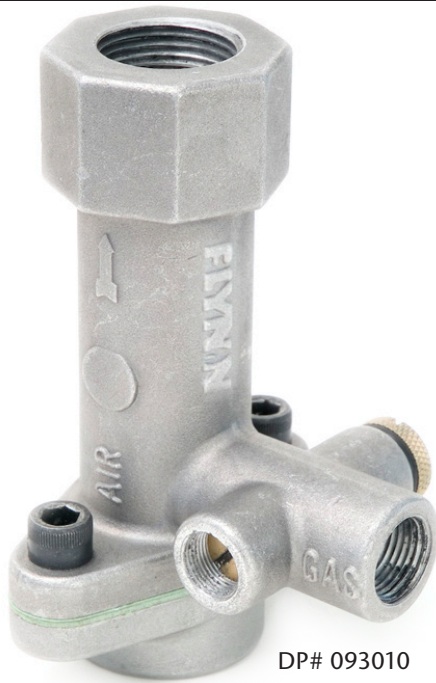
DP# 093010 (3/4" NPT INLET - 3/4" NPT OUTLET)