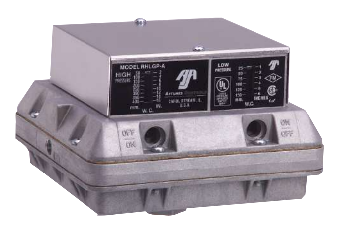
Model RHLGP-A High-Low Gas Switch Recycle Type

Model HGP-A High-Low Gas Switch with Reset Lever