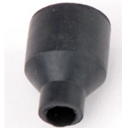
3 Rubber Boot