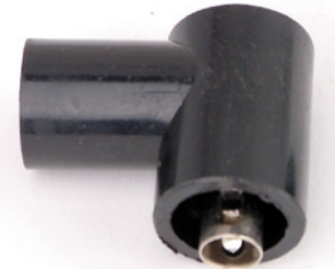
For use with 6 Spark Monitor