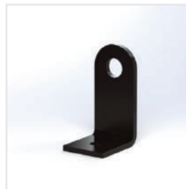
FMB-2 (5.1 mm diam.) Mini Glass Fiber Optic