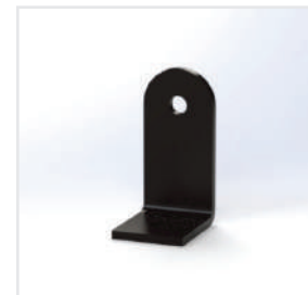
FMB-3 (3.1 mm diam.) Mini Plastic Fiber Optic