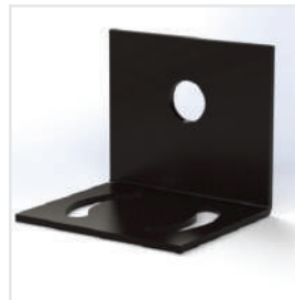
FMB-1 (8.4 mm diam.) Standard Fiber Optic