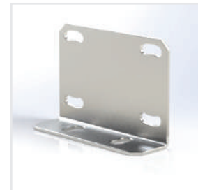
SEB-3 Stainless L Bracket