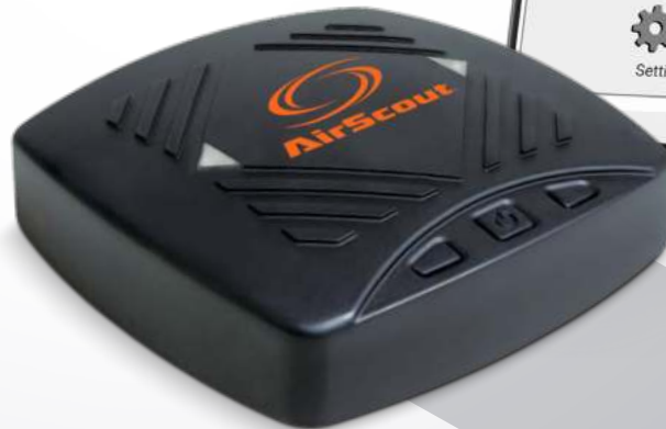
- Test List