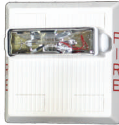
SERIES MT STROBE