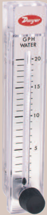
Model RMB-SSV 5" scale, 8-3/4" high